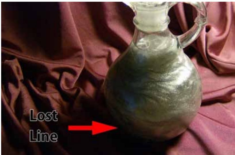
Obscured Light Lost Line

Now that we know what lost and found lines are, let's look at how they can help us in our artworks.