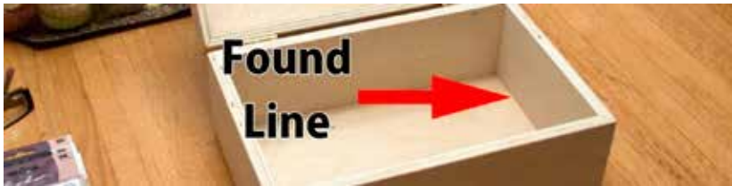
Corner Found Line

A lost line on the other hand is where you would expect to see a quick change in tone or colour, but don't. Let me illustrate: