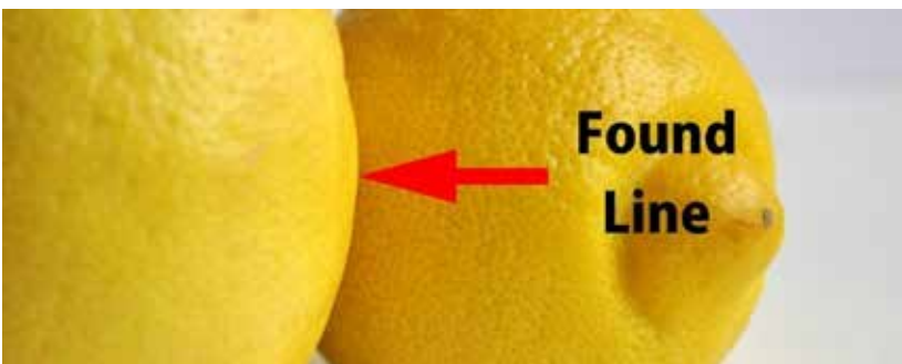
Distance Found Line