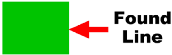
Colour Change Found Line